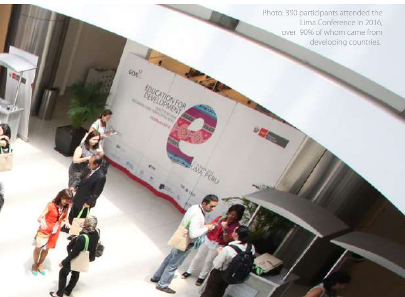
Photo: 390 participants attended the Lima Conference in 2016, over 90% of whom came from developing countries.

The conference will last two and a half days, during which the themes will be discussed in 90 minute plenaries. A further 15-20 parallel sessions will discuss the subthemes in depth. Other features will include special keynotes, awards, essay competitions, posters and side events.