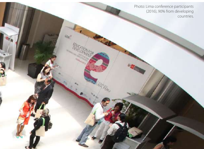
Photo: Lima conference participants (2016), 90% from developing countries.

If you are interested in attending as a participant, keep an eye out on www.gdn.int/conference2019 for upcoming calls, registration and more details.