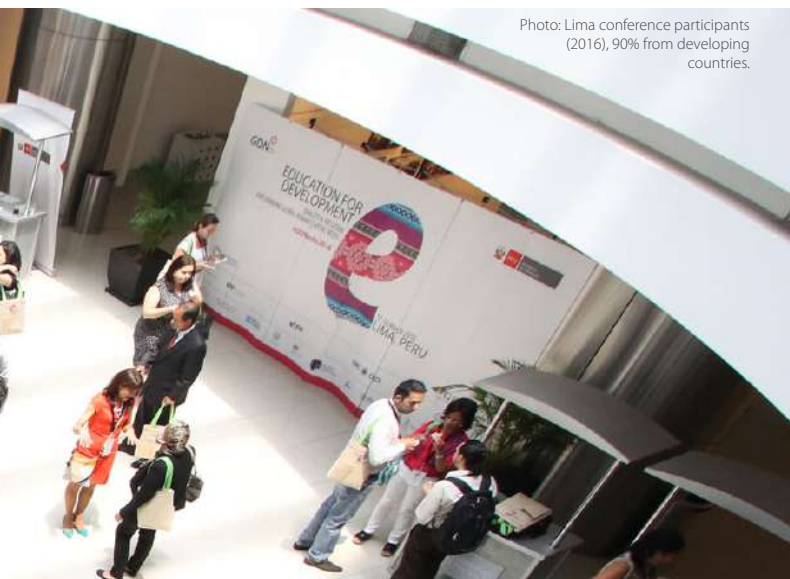
Photo: Lima conference participants (2016), 90% from developing countries.

If you are interested in attending as a participant, keep an eye out on www.gdn.int/conference2019 for upcoming calls, registration and more details.